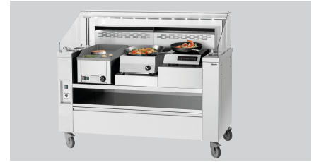
► Designed for KST Plus cooking stations