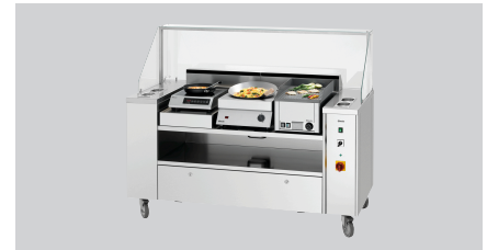
► Designed for KST Eco cooking station