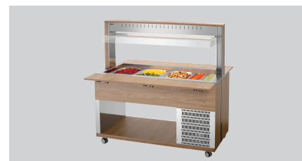
▶ Buffet cart for cold food