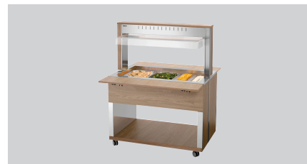
▶ Buffet cart for hot food