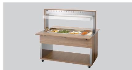
▶ Buffet cart for hot food