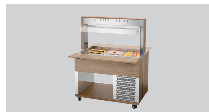
▶ Buffet cart for cold food