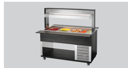
▶ Buffet cart for cold food