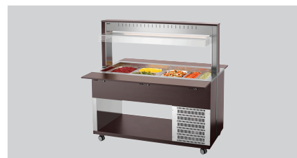
▶ Buffet cart for cold food