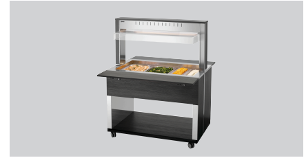
▶ Buffet cart for hot food