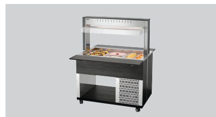
▶ Buffet cart for cold food