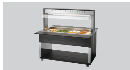
▶ Buffet cart for hot food