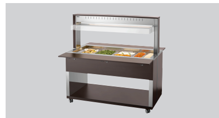
▶ Buffet cart for hot food