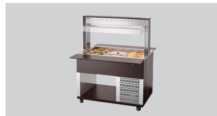
▶ Buffet cart for cold food