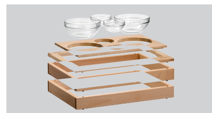
▶ Simple connecting system