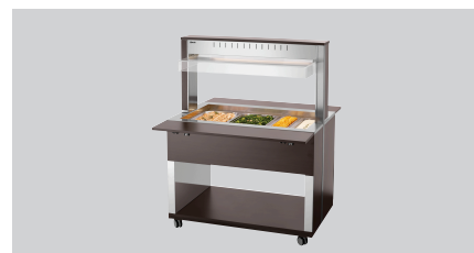
▶ Buffet cart for hot food