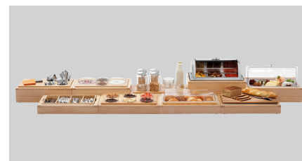
▶ Buffet system set in simple wood design