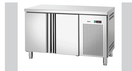
► High-quality stainless steel work surface