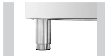
► Height-adjustable feet