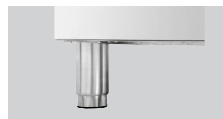
► Height-adjustable feet