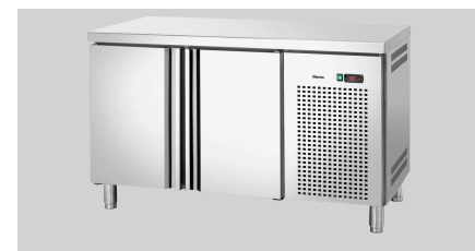
► High-quality stainless steel work surface