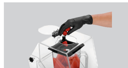
► Opening for filling shaft ✓ With cover flap