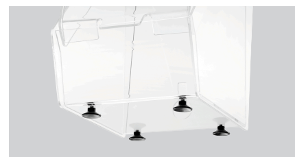
► Secure stand ✓ 4 suction pads