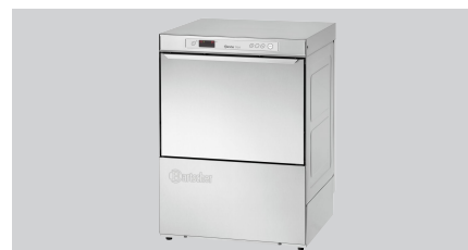
► Designed for dishwasher Deltamat TF517